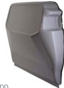
MV3-0501 H DD