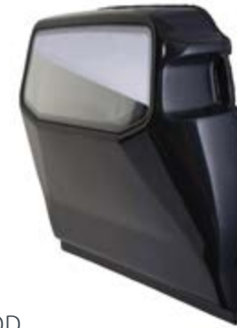
MV3-0500 H DD